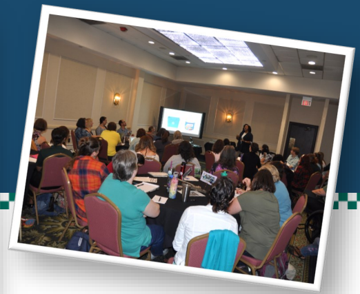
Attendees at one of 35 sessions