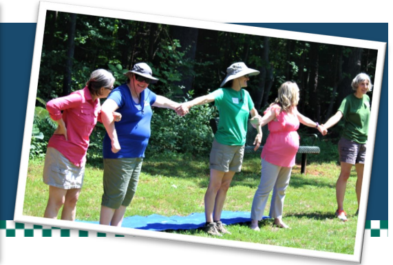
Mini-Conference attendees enjoying the various hands-on activities.