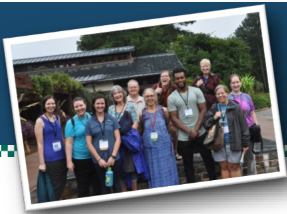
Conference attendees at a field trip at Duke Gardens