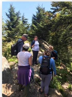
Western Section Chair leading a hike in the Smokies.

In total, over 294 people attended 25 section events across the state!