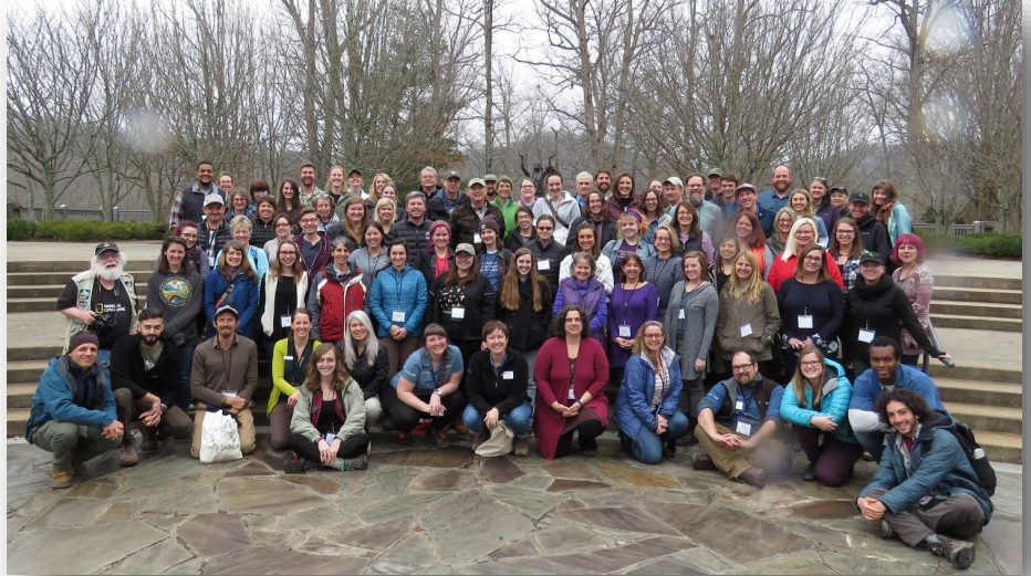
EENC and NCAEEC joint conference attendees.

The joint meeting ended with field experiences to the Highland Biological Station, Biltmore Estate, Asheville Museum of Science and Botanical Gardens, Chimney Rock State Park, Intro to Schoolyard Citizen Science with the NC Arboretum and Track Trails and a hike with Southern Appalachian Highlands Conservancy. Overall, the event was a success with over 130 attendees and provided an opportunity for both organizations to network together.