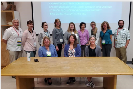
2019 First Higher Education Summit

The next two days were filled with 36 peer driven sessions, a research symposium, section meetings and first time