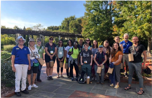
Field trip to Daniel Stowe Botanical Gardens

The EENC Board and staff were excited to host the first full conference in the Piedmont section since its creation in 2015. The Schiele Museum of Natural Sciences in Gastonia provided a unique location with exhibits available throughout the conference for participants to enjoy.