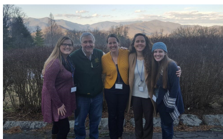
Board and staff at the SEEA Leadership Clinic in March

March was another busy month with our Mini-Conference and Southeastern Environmental Education Alliance's (SEEA) Leadership Summit. Board members and staff received valuable training, networked with other Southeastern EE organizations and devoted time to develop a membership plan for the organization. SEEA awarded each affiliate $5,000 to implement their plan and EENC conducted a membership survey in partnership with North Carolina State University.